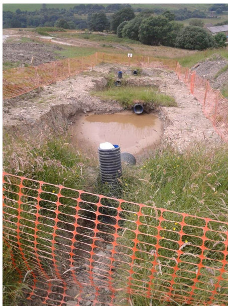
Plate 5: Typical lagoon and flocculent station