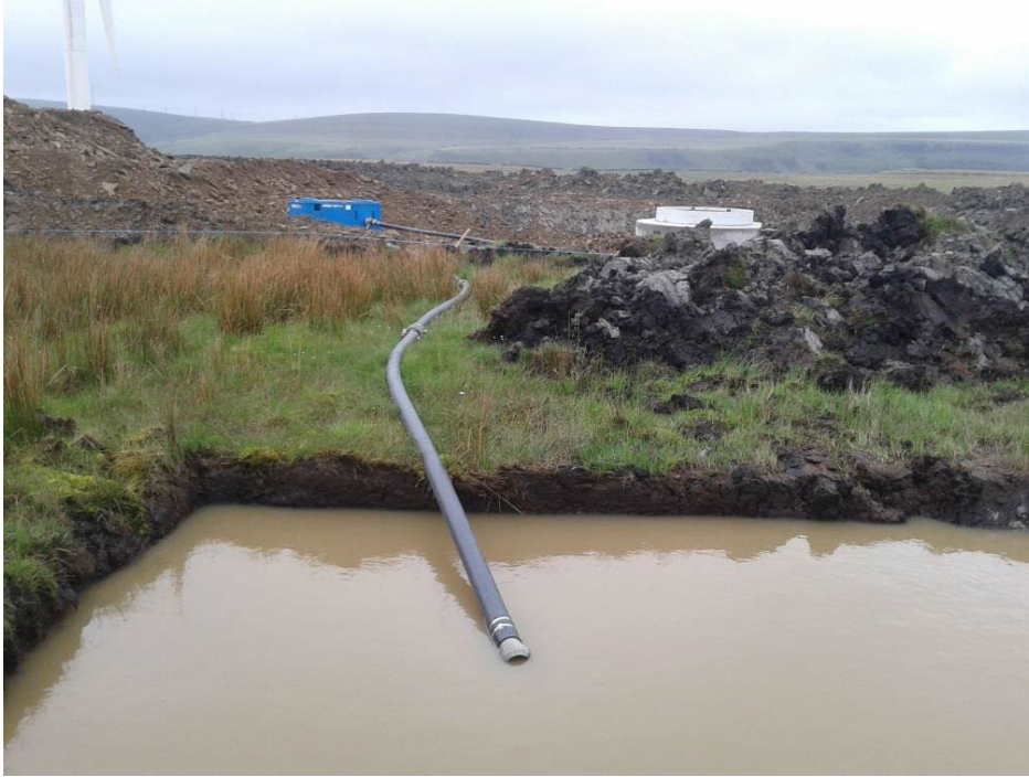
Plate 6: Typical 'Siltbuster' and settlement lagoon