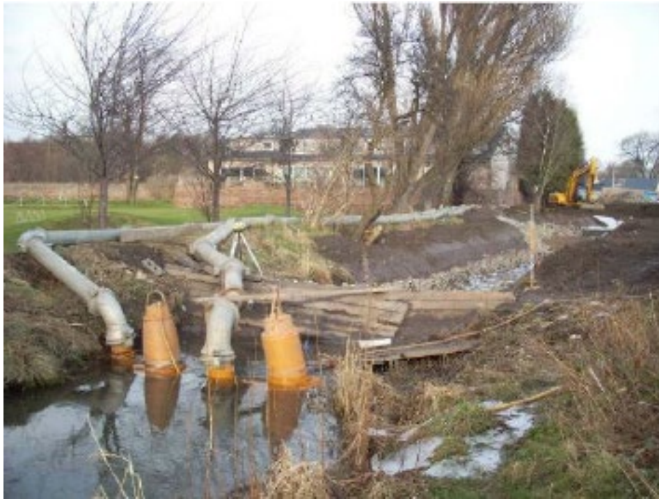
Plate 8: Full isolation - over pumping/siphon